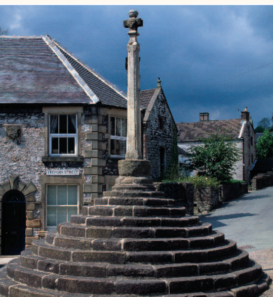
The village cross at Bonsall