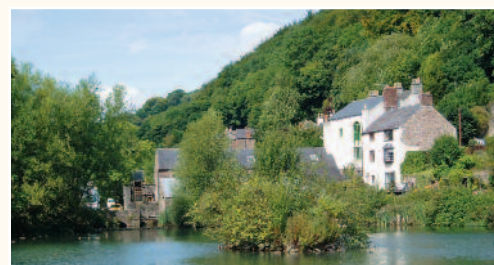
Mill Pond at Cromford

Square. The village is part of the Derwent Valley Mills World Heritage Site where Richard Arkwright set up his cotton-spinning mills powered by the River Derwent.