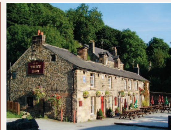
The White Lion at Starkholmes