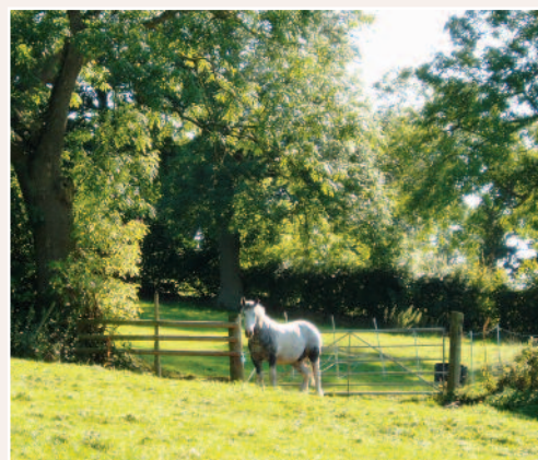
On the path up to Riber