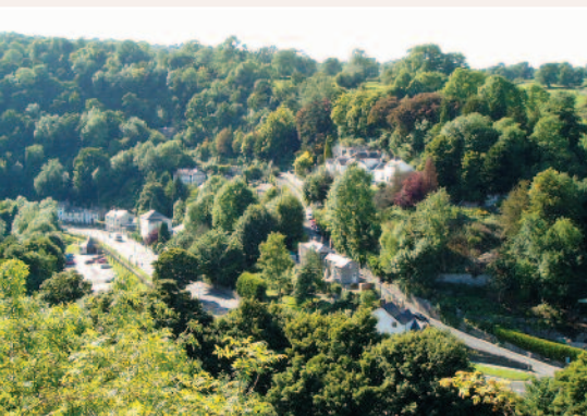
Looking down to the A6 from High Tor

Follow the path and turn left up the steps through the entrance to High Tor Grounds into the woods.