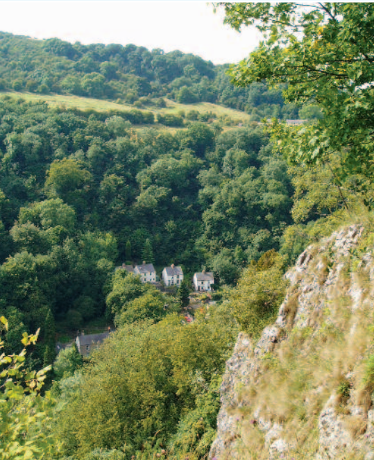
The view from near Giddy Edge

To continue your walk go diagonally left across the car park, heading for the 'coaches only' bay. Along the perimeter you'll see two semicircular walls. At the gap you'll find a sign - 'Footpath to Lovers Walk'. Follow the gravel path that bears right uphill and enters some woodland. Turn left and follow the stepped path continuing uphill to the summit viewpoint. From here you can see Matlock Bath below and Gulliver's Kingdom (Theme Park) across the valley opposite. A post and rail fence on the left guides you along the path, which soon levels out. When a fence ahead bars the route you should turn right and follow the stepped path down the cliffs. Always keep to the downward path if there's a choice and keep to the footpath at all times. At the riverbank, turn right. Cross the footbridge over the Derwent and turn right to walk through the gardens. Leave through the gates and go on ahead through a gap in the wall and bear left past some public toilets. Turn right across the front of the Grand Pavilion which houses the Peak District Mining Museum and the Tourist Information Point. The bus stop to return to Matlock is on the opposite side of the road, or you can complete a circular walk back by following Walk 4.