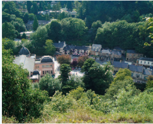
The view down to Matlock Bath

As you leave the park continue straight ahead onto a road called Knowleston Place. Look for a signpost that directs you to the right, over a small bridge into Pic Tor Park. Follow the path that runs between the cliffs and the river, which is known as The Promenade.